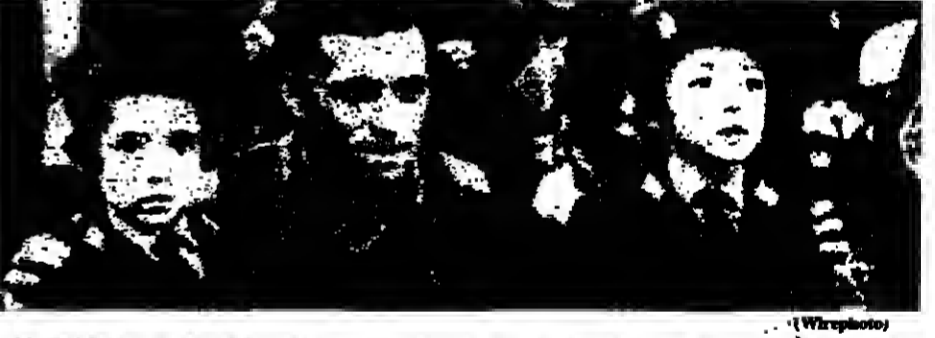
KIDNAPPED STAR RELEASED: Soccer Star Enrique "Quini" Castro, the Barcelona forward, pictured with his two sons dressed in national police uniforms for his return.